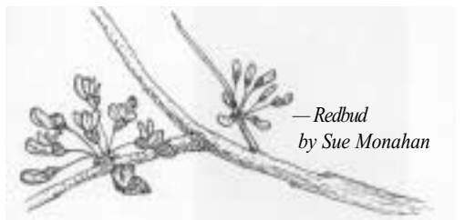
—Redbud by Sue Monahan

In addition to the 5% Day contributions, Whole Foods Markets annually donates their time and product at the Festival by organizing and running the Watermelon and Apple Juice booths, and donating all proceeds to the Festival.