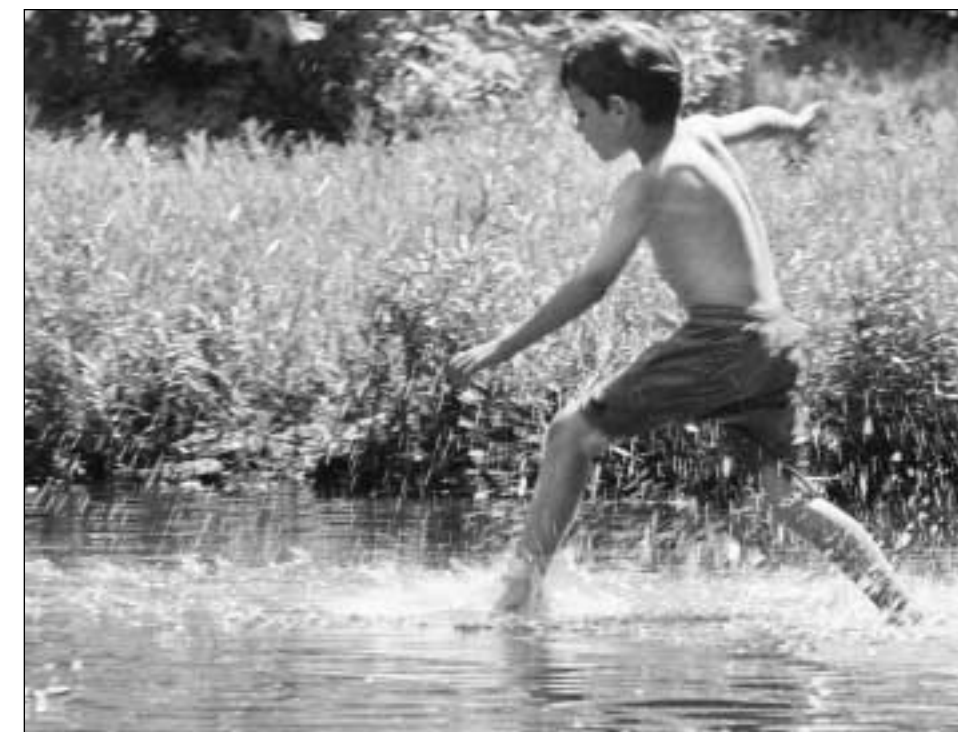
Splashing in the Waters