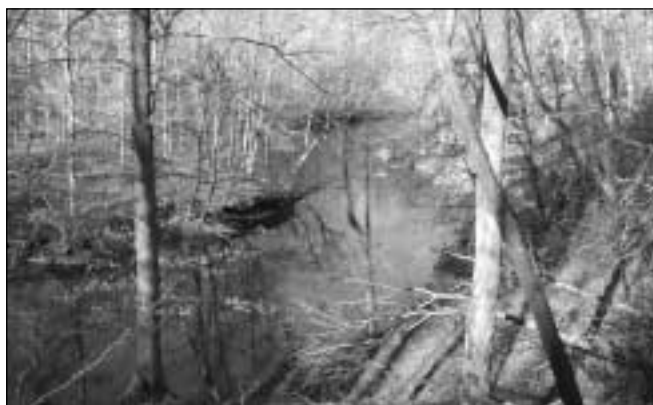
Eno River flowing through the Eno Wilderness