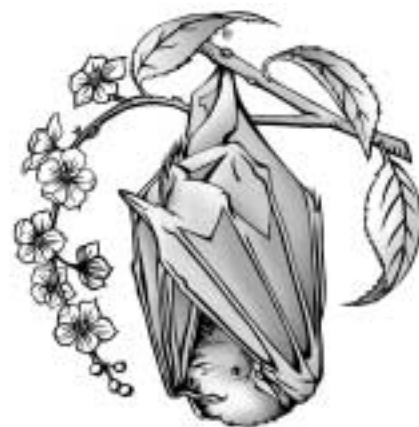
Eastern Red Bat.