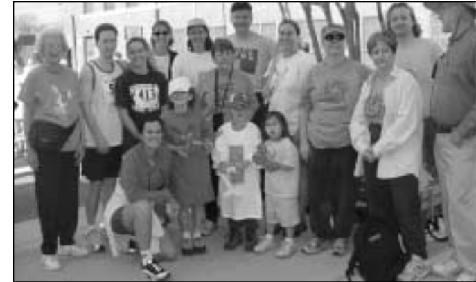
Some of the ERA runners gather before the race.

On a bright March morning, a crowd of volunteer fundraisers gathered under the Eno River Association sign to start the 2003 Great Human Race put on by the Volunteer Center of Greater Durham. With a bang, the runners were off, racing along the 5K course through downtown Durham. Following behind them were racers young and old, running, walking, rolling, and strolling to raise money for their favorite non-profit organization.