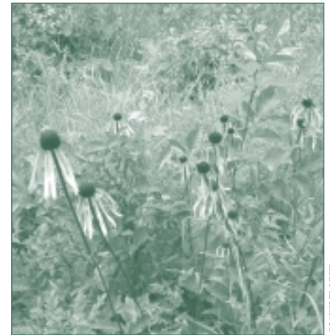
Smooth Purple Coneflower, Echinacea laevigata