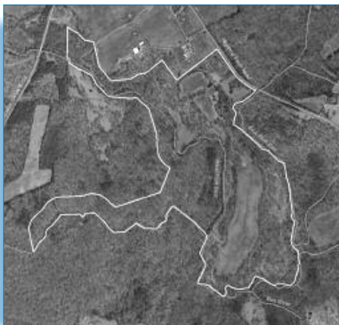
Aerial photo of the properties at the Confluence of the Eno River.

frontage designated as a Significant Natural Heritage Area. Rare mussels are known to exist in the stream along this property, and our protection of the land will help ensure their continued habitat. A project of this size rarely happens alone, and we had several generous