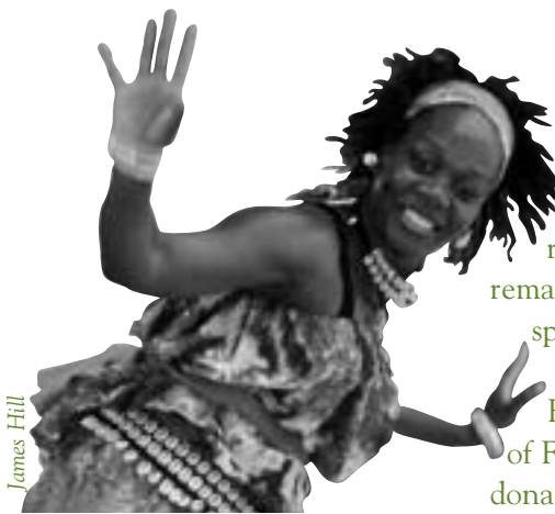
African-American Dance Ensemble