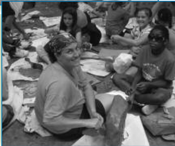
iWalk staff photo