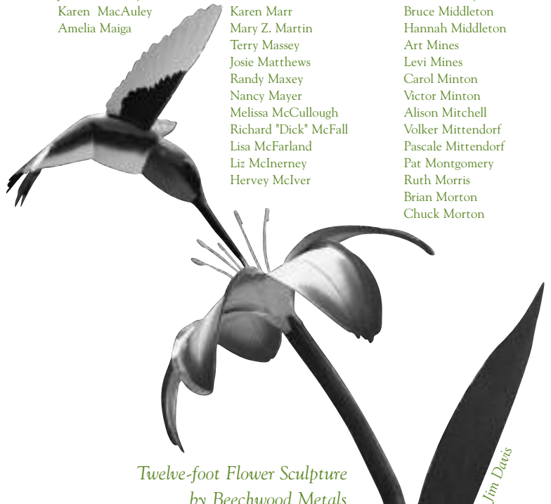
Twelve-foot Flower Sculpture by Beechwood Metals