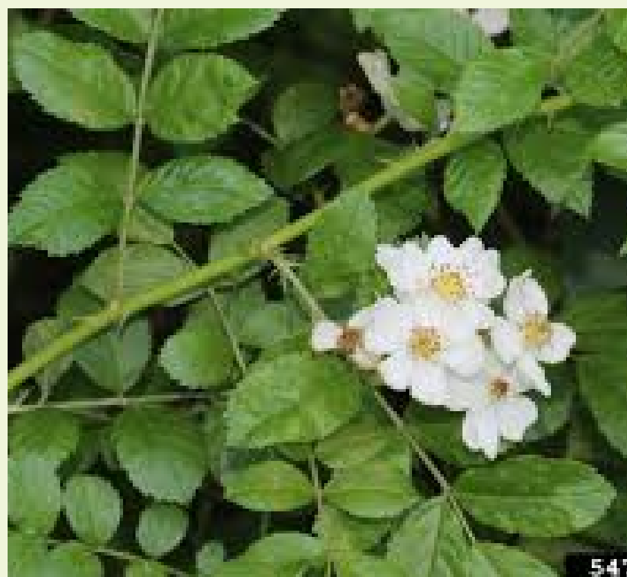
MULTIFLORA ROSE ( Rosa multiflora )