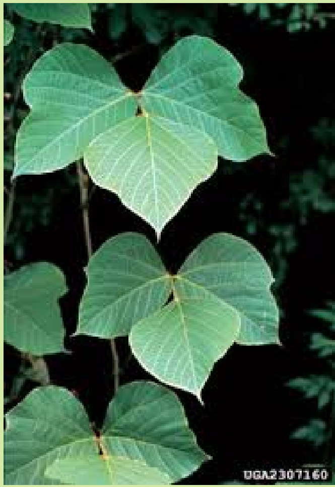
KUDZU ( Pueraria montana )