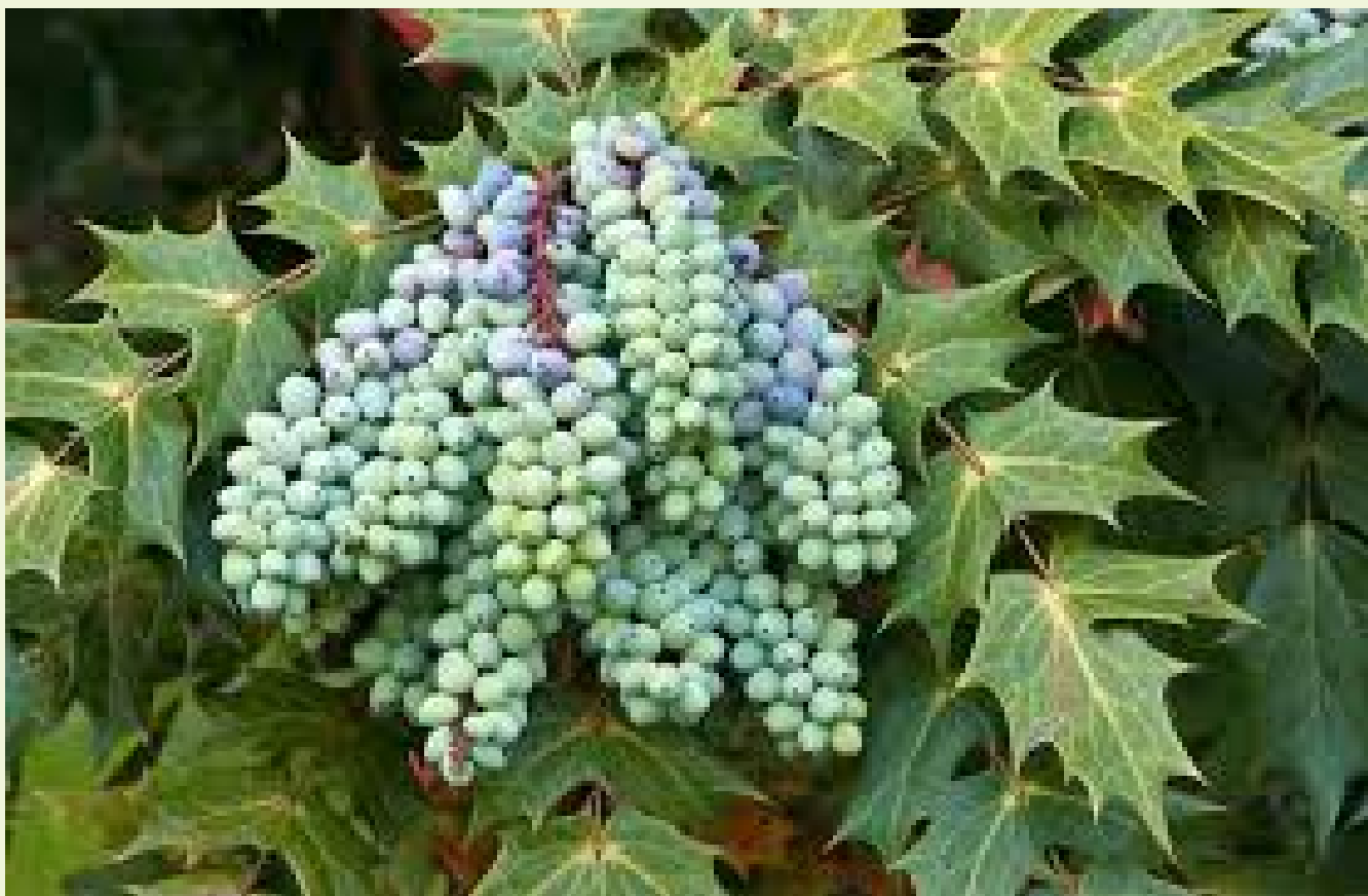
LEATHERLEAF MAHONIA ( Berberis bealei )