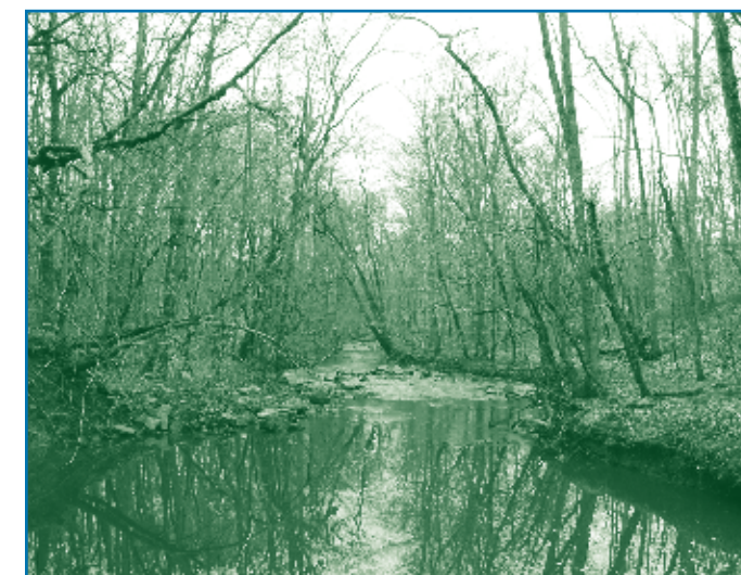
Upper Eno, Confluence area

conservation properties. Volunteers have also helped with rare plant enhancement activities at the Blue Indigo Slopes Nature Preserve and several partner properties within the Diabase region of the Lower Eno. Altogether, 19 workdays were held over the past year, involving more than 150 volunteers and 450 volunteer hours. Thank you to these volunteers for doing all the dirty work. A full slate of workdays is planned for 2011. If you are interested in helping, please email stewardship@enoriver.org to get your name added to our stewardship volunteer email list.