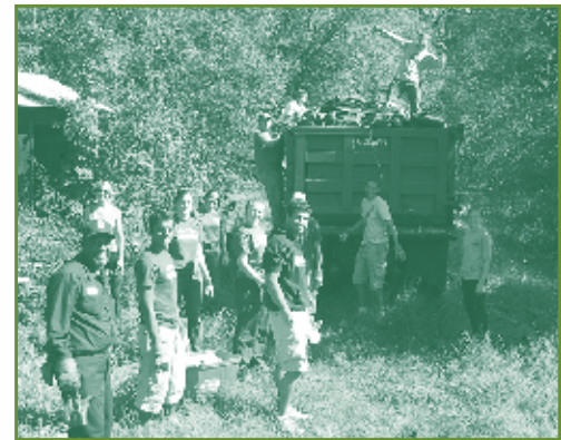
Coulter Conservation Area Cleanup