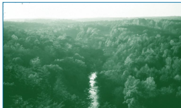
Eno River from Oconeechee